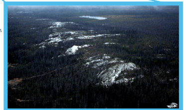
Aerial view of Pegmatite outcrop over 2km in length